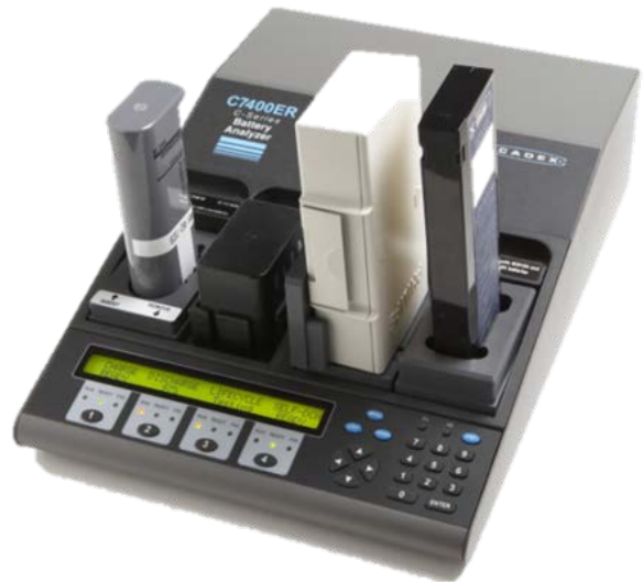
Cadex C7400ER Battery Analyzer Recommended for Healthcare

Battery maintenance assures that all batteries meet a minimal required performance level. Each battery is kept for its full service life and is only replaced when the capacity falls below the set capacity threshold. This results in improved reliability without fear of unexpected downtime.